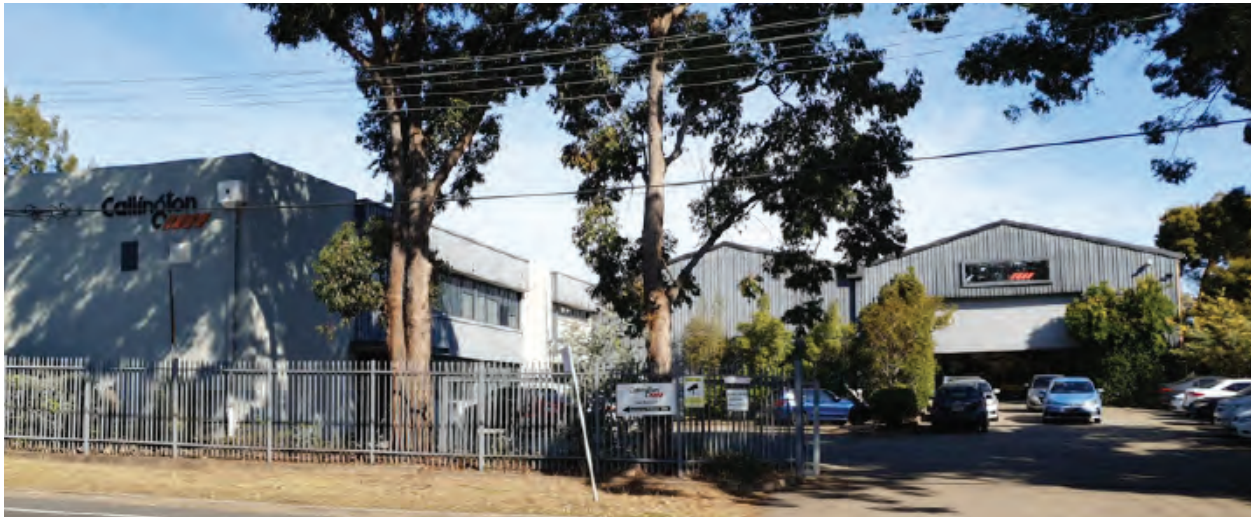
Global Head Office, Sydney Australia