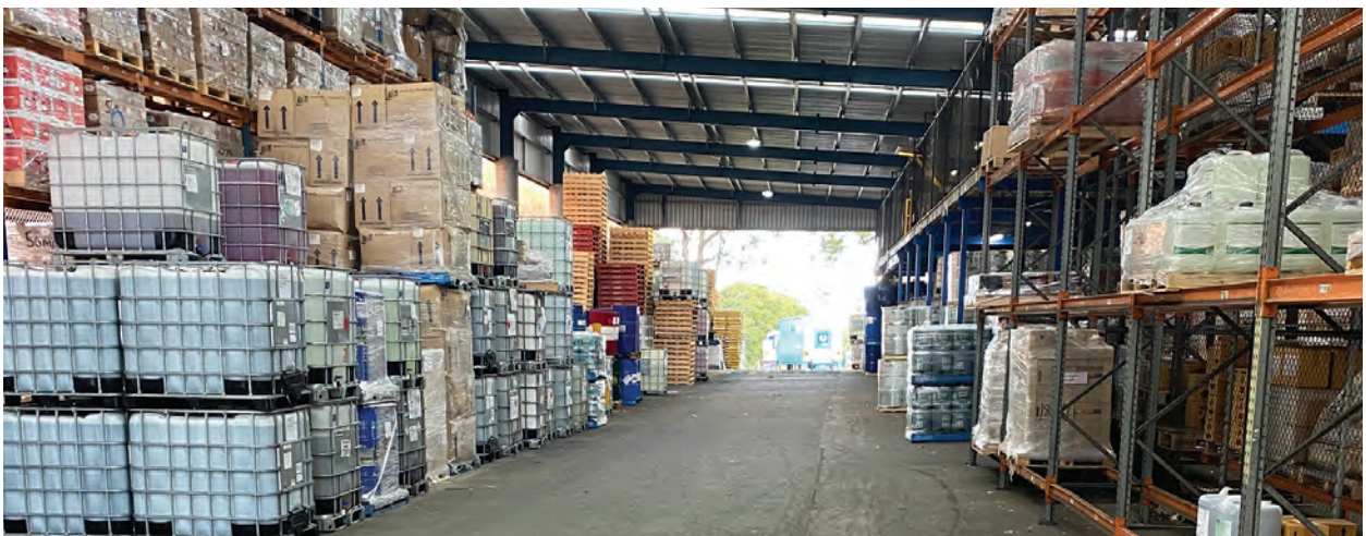
Warehouse Facility - Dual entry